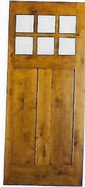
NEW DOOR STYLE EXAMPLE

GREGORY WOODWORKS ARCHITECTURE 1000 N. MAIN ST. SUITE 100 NANTUCKET, MA 02551 PHONE: 508.339.1111 FAX: 508.339.1112 WWW.GREGORYWOODWORKS.COM A-4