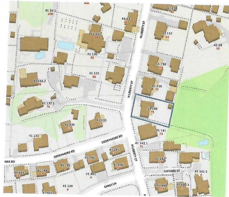
MAP 41 PARCEL 140

SIZE: 5,000 S.F. 9,120 S.F.± NTAGE: 50 FT. SEE PLAN SETBACK: 0 FT. SEE PLAN EBACK: 5 FT. SEE PLAN ER %: 50% 15% ±