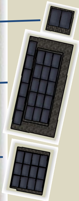
Proposed Array Placement