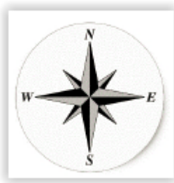
Site Locus Plan